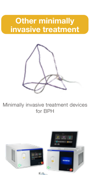
Thulium fiber laser systems